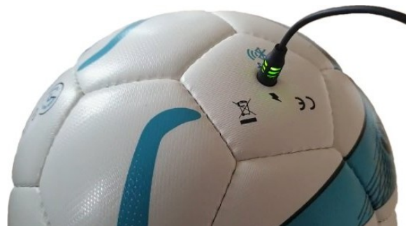
PURE magnet-USB connector, charge cable included 500mAh LiPo battery